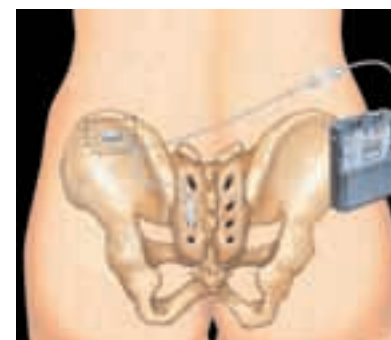
Stage 1 hospital-based trial procedure.

InterStim Therapy is unique in that test stimulation is performed to assess the effectiveness of the therapy prior to placing the permanent implant. This can be done with a simple office-based test or as an outpatient procedure at the hospital. Local anesthesia is required. Two small incisions are made in the skin. A lead wire is placed just under the skin through a very small incision over the sacrum, just to the side of the sacrum's midline. In the outpatient option, a temporary lead extension is placed just under the skin through a second slightly larger incision over the upper buttock. The temporary lead